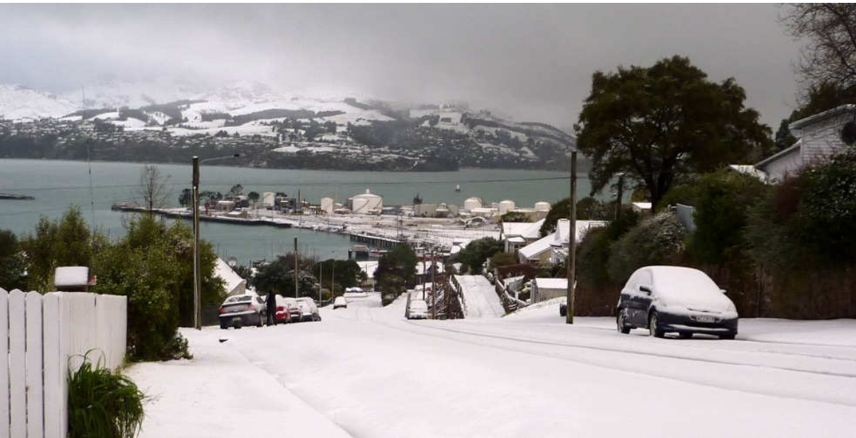
Image: Voelas Road toward Lyttelton Port and Diamond Harbour

By the time we get to Friday 29 July - the weather is looking all clear for the Festival of Lights!