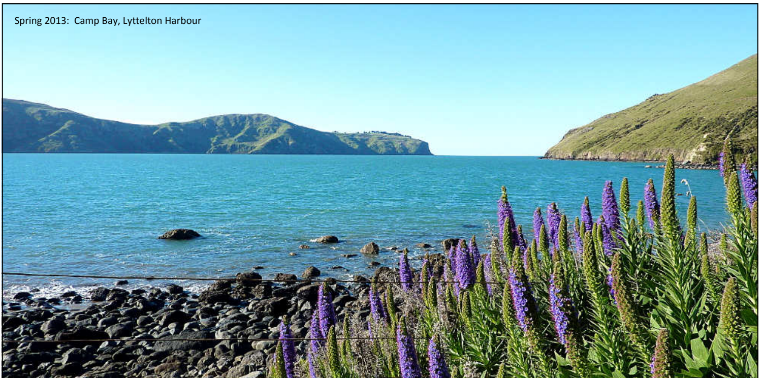
Spring 2013: Camp Bay, Lyttelton Harbour

If you can't make it, please contact us as we are more than happy to provide advice one on one.