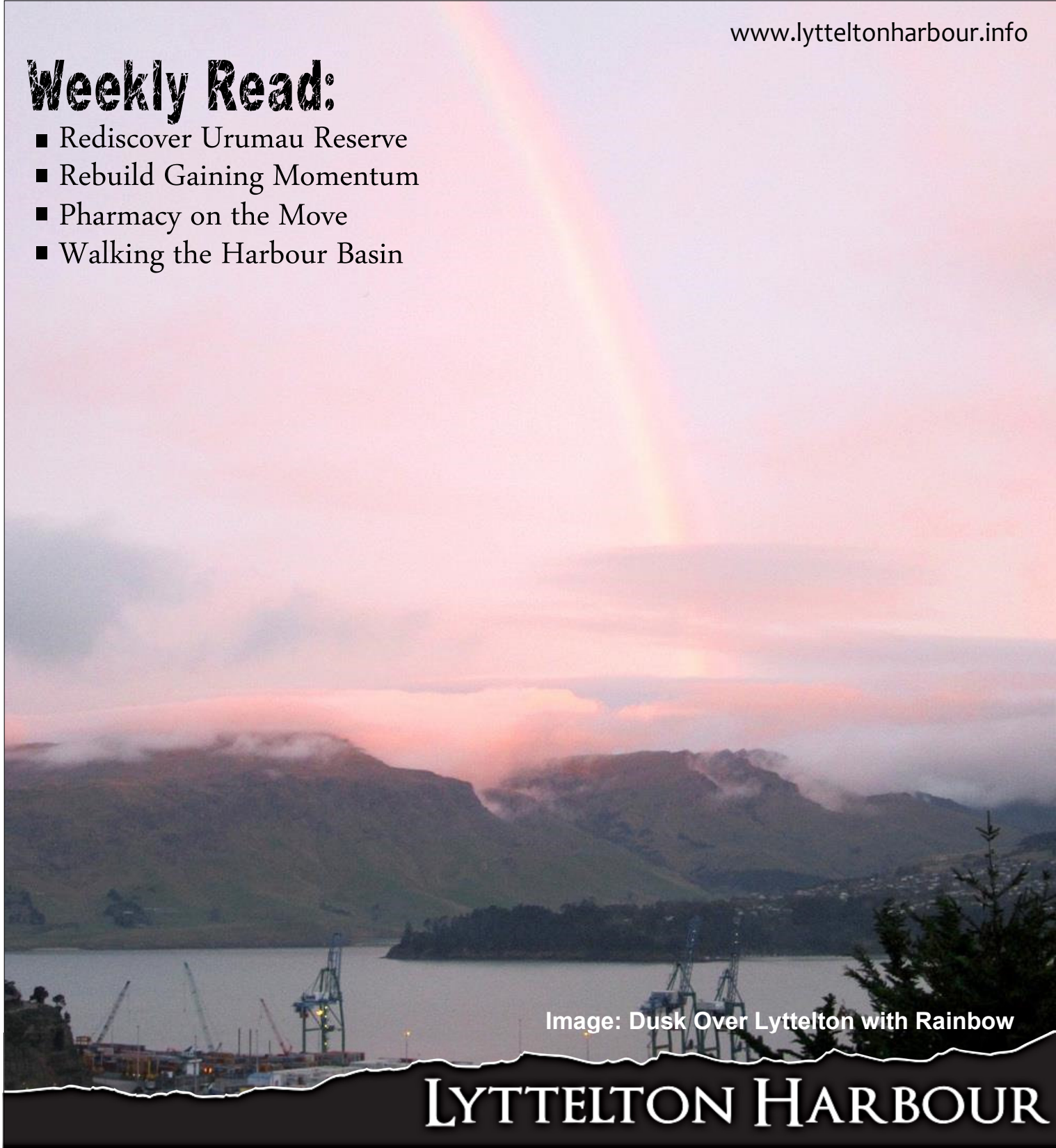
Image: Dusk Over Lyttelton with Rainbow