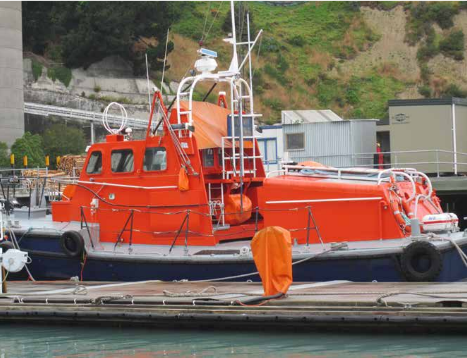
Lyttelton Port Company Pilot Boat

PURAU • DIAMOND HARBOUR • CHURCH BAY • CHARTERIS BAY • GOVERNORS BAY • RAPAKI • CASS BAY • CORSAIR BAY • LYTTELTON