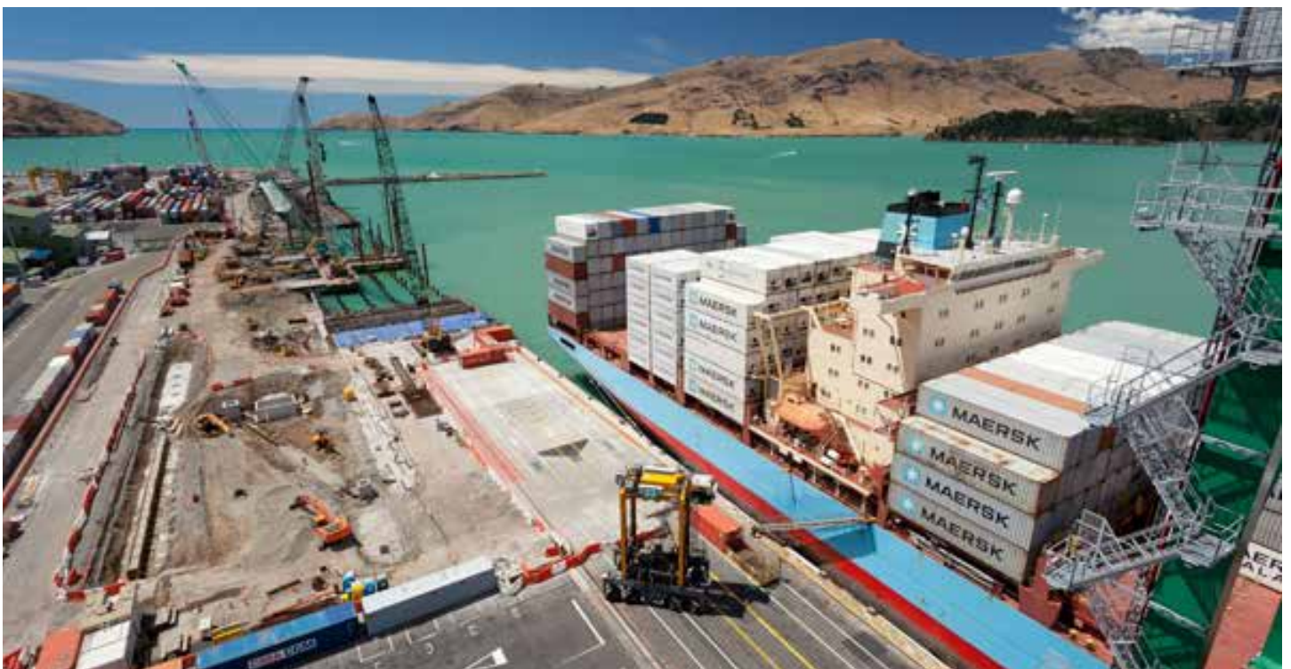
The 266 metre Lars Maersk container vessel occupying the new berth at Lyttelton Port’s Cashin Quay 2 wharf, while the Pacifica’s Spirit of Endurance is berthed beside it.

“The new Cashin Quay 2 wharf is an important part of the long term plan to ensure we have a thriving Port that supports the Canterbury economy and the Christchurch earthquake recovery.”