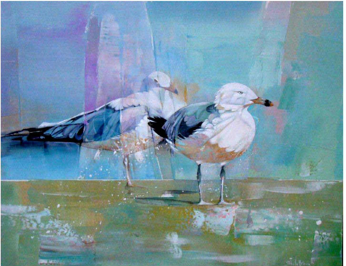
Thoughts of Summer - Sheila Brown