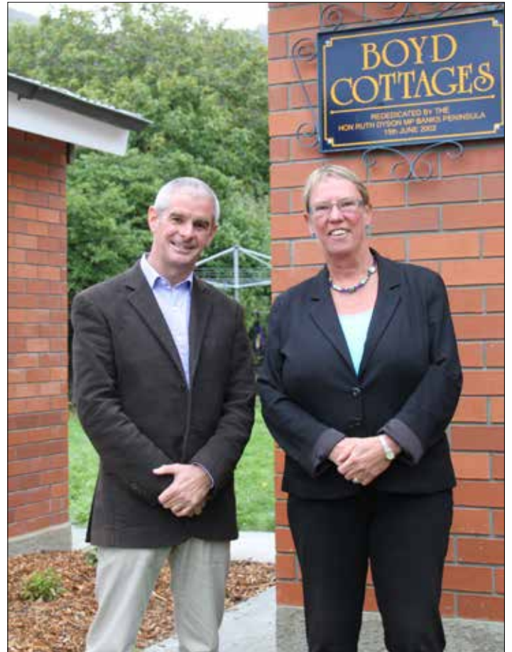
Photo and facts and figures supplied by Christchurch City Council. Thanks.