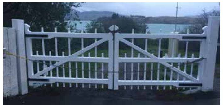
The White Gates fully restored at the entrance to the Head to Head Coastal Pathway