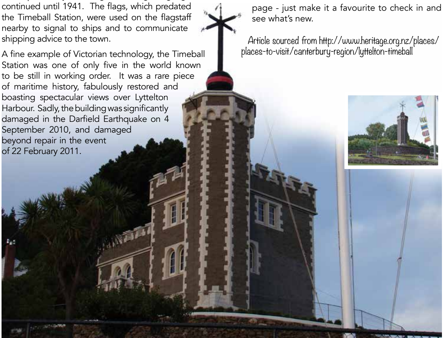
Before the earthquakes, standing tall. Inset: Artist's impression of the rebuilt tower. expand/collapse

Article sourced from http://www.heritage.org.nz/places/places-to-visit/canterbury-region/lyttelton-timeball