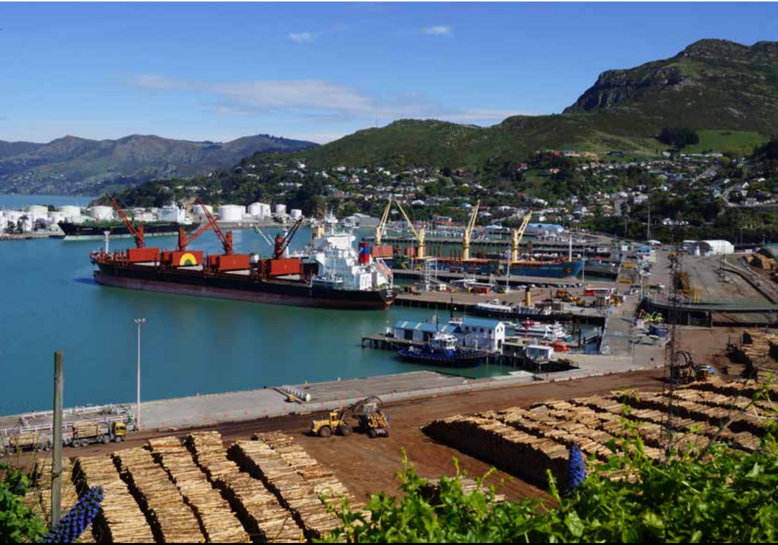
Lyttelton Port View

PURAU • DIAMOND HARBOUR • CHURCH BAY • CHARTERIS BAY • GOVERNORS BAY • RAPAKI • CASS BAY • CORSAIR BAY • LYTTELTON