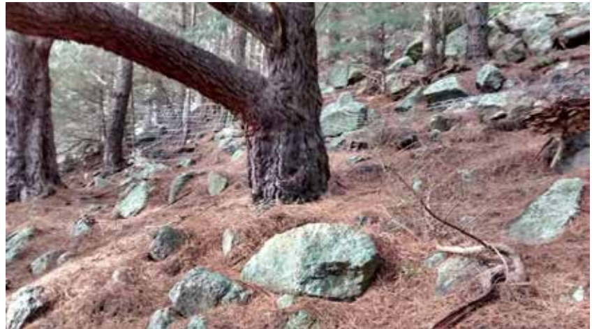
Rocks and pine trees in the Plantation

Since then, the pine trees have helped to keep the rocks at bay and now they are providing shelter to regenerating native plants.