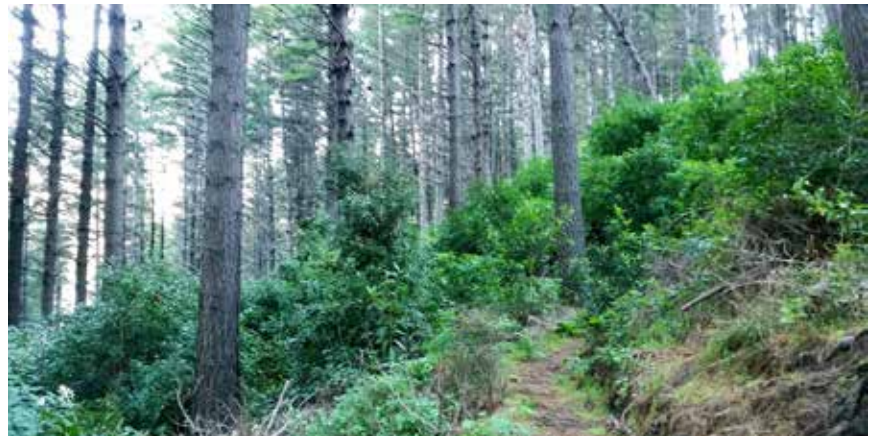
Deep inside the Plantation, nature lurks

Since then, the pine trees have helped to keep the rocks at bay and now they are providing shelter to regenerating native plants.