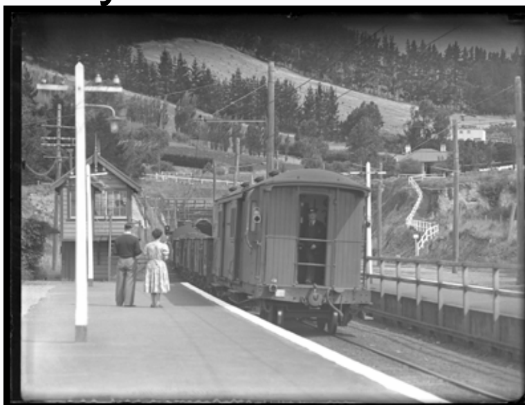
Heathcote Station 1949