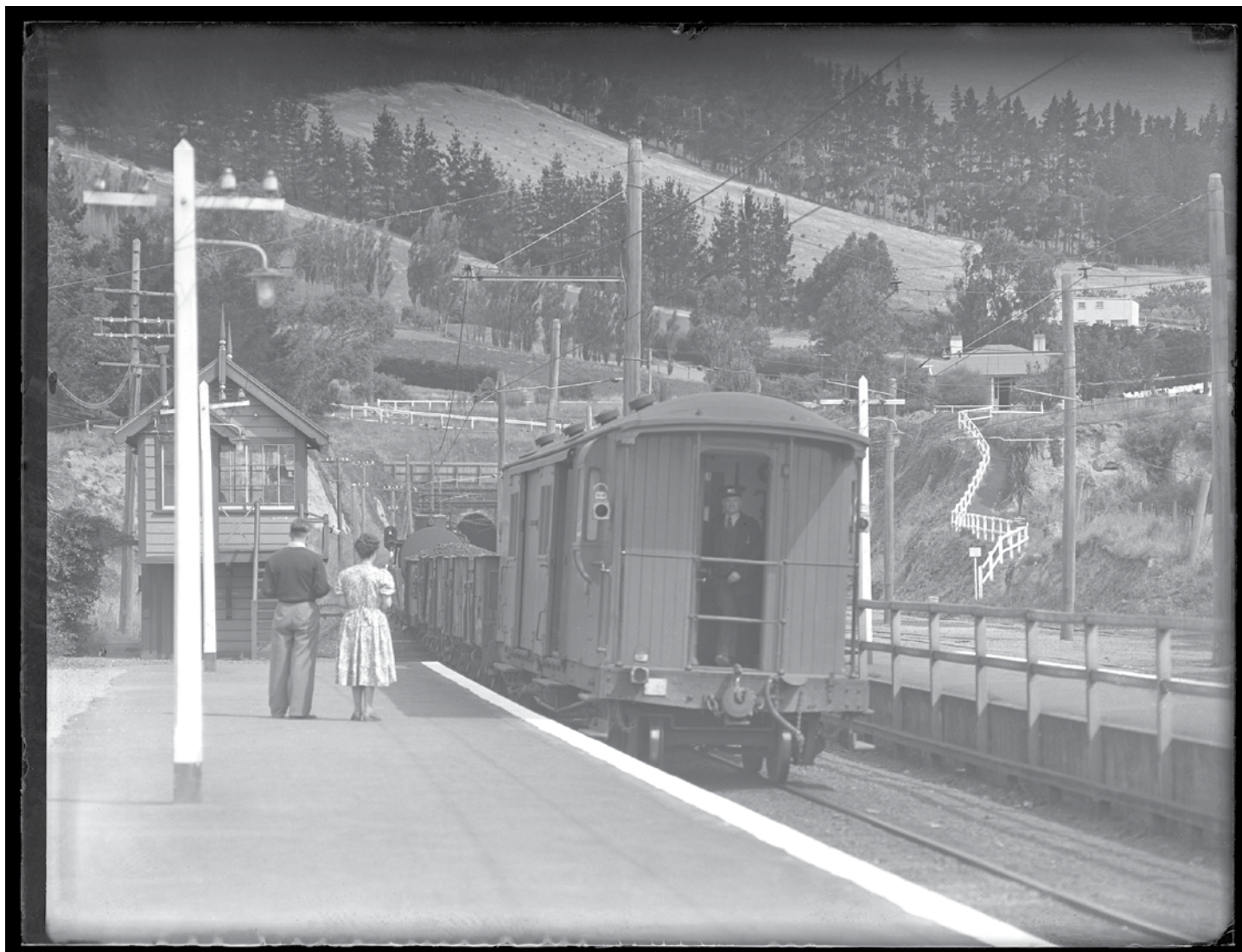
Photo: Heathcote Station 1949