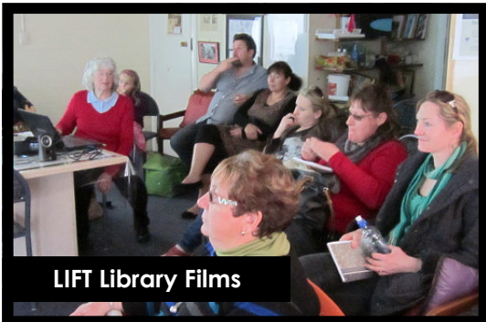
LIFT Library Films