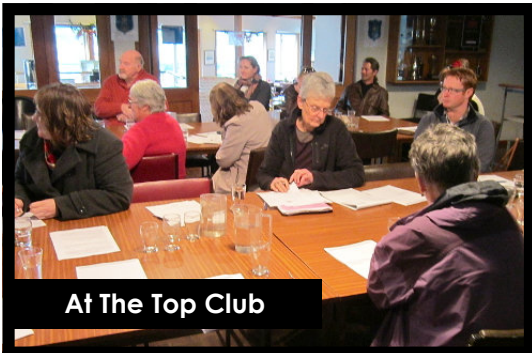
At The Top Club