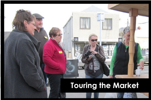
Touring the Market